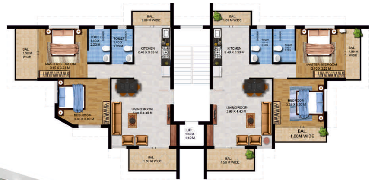
TYPICAL FIRST SECOND & THIRD FLOOR PLAN